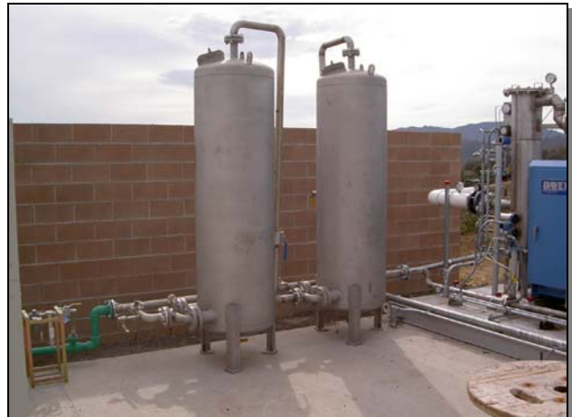
Figure 3 – Dual stainless steel siloxane filters in series

The 30 percent methane content at the flare station was below Capstone's 35 percent specification, resulting in a decision to intermix gas from ten higher-Btu LFG wells. A separate above-grade header was installed to connect these wells to the microturbine plant. In order to minimize any impacts to the well field that could result from any intermittent operation of the microturbine plant, two design features were implemented: