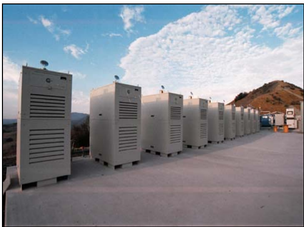
Figure 1 – Ten Capstone C30 MicroTurbines