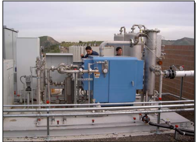
Figure 2 – Fuel treatment system including compression and drying components