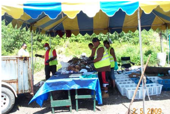
Figure 2. Photo of Waste Collection Sort

Samples were manually sorted into 53 material categories, and the material in each category was weighed. The largest component of the overall waste stream is paper and related material, as shown in Figure 3. Organics and metals comprised the next largest components, at 20% and 18%, respectively. The remaining waste types together accounted for about 46% of the landfill's waste stream.