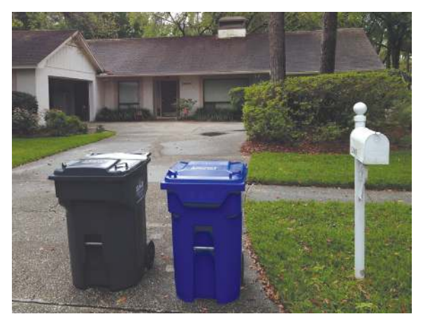
Exhibit I. Example of Automated Carts/Container

lection, the driver positions the collection vehicle beside the cart. Using controls inside the cab of the vehicle, the driver maneuvers a side-mounted arm to pick up the container and dump its contents into the hopper of the vehicle. The driver then uses the arm to place the container back onto the curb. Under this type of collection system, the driver is able to service the entire route; the need for additional manual labor is eliminated. The savings in personnel and worker's compensation costs, as well as the increase in