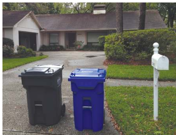
Exhibit 1. Example of Automated Carts/Container

For this type of collection system, residents are provided a standardized container into which they place their waste (Exhibit 1). Residents must place their cart at the curb on collection day. During collection, the driver positions the collection vehicle beside the cart. Using controls inside the cab of the vehicle, the driver maneuvers a side-mounted arm to pick up the container and dump its contents into the hopper of the vehicle. The driver then uses the arm to place the container back onto the curb. Under this type of collection system, the driver is able to service the entire route; the need for additional manual labor is eliminated. The savings in personnel and worker's compensation costs, as well as the increase in