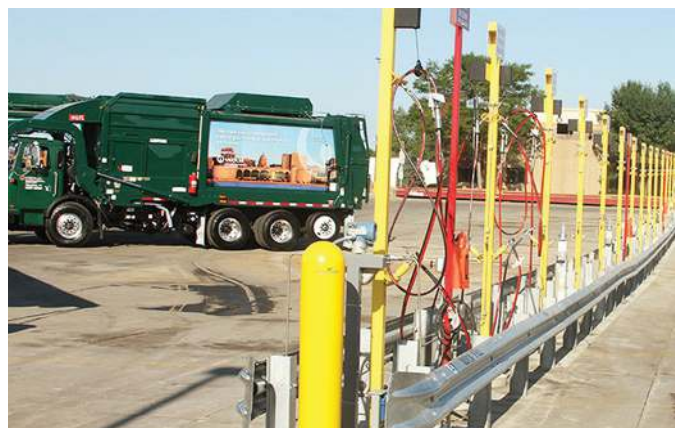
Exhibit 2. Time-Fill CNG Station

Using time-fill, vehicles refuel more slowly, and therefore receive