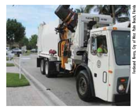
Many communities, like the City of West Palm Beach, Florida, switched to residential automated collection service as a means to improve levels of service, while at the same time reducing worker injuries.

reduced workers compensation costs, decreasing disability claims, decreasing the number and cost of light duty assignments, and reducing salary fringe benefit costs in the future. For the estimated 130.000 men and