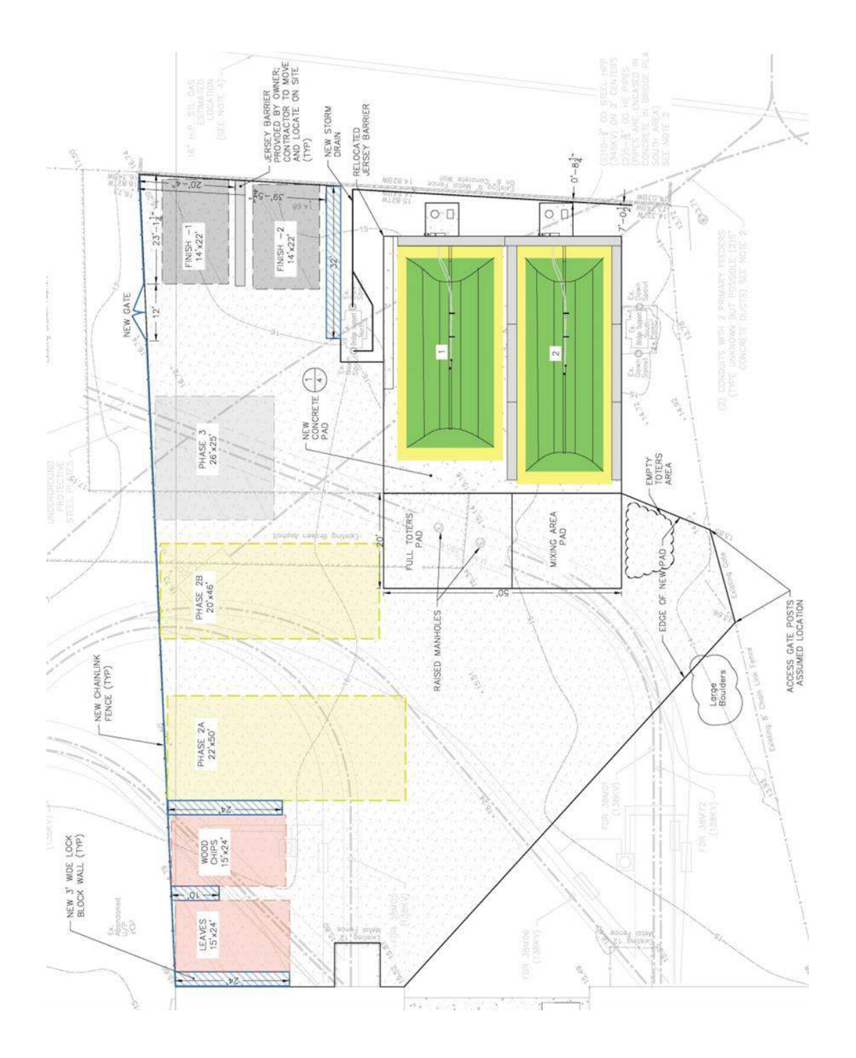
Figure 2: Site Plan