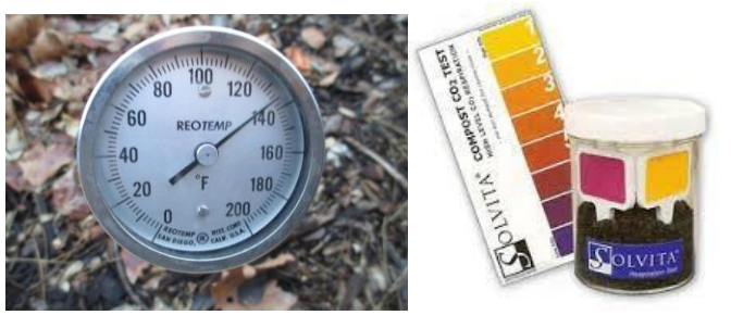
Figure 5. Temperature probe, Solvita Maturity Test