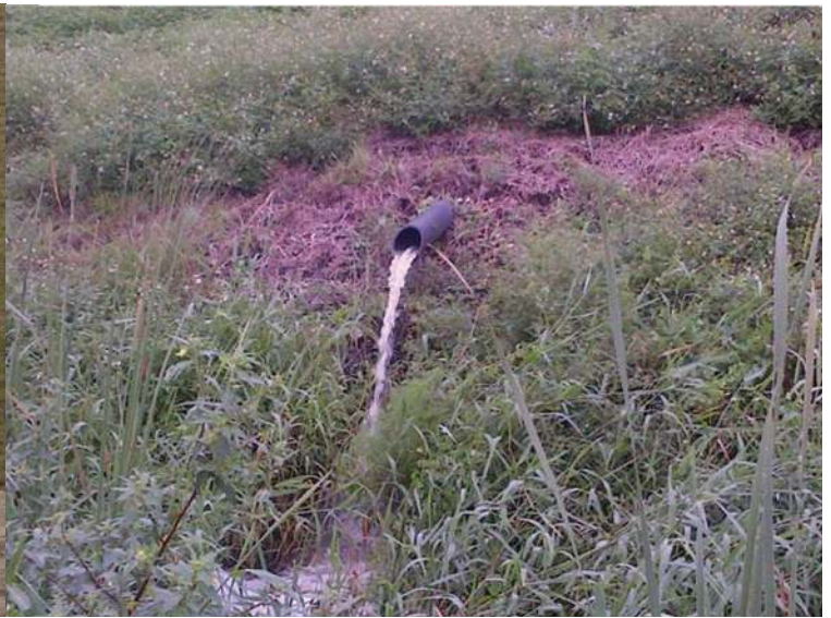
Photo 9: The RTDS working to eliminate trapped water following a storm.

up in the drainage layer at the lower portions of the landfill slope, thus creating a condition that promotes stability of the slope. | WA