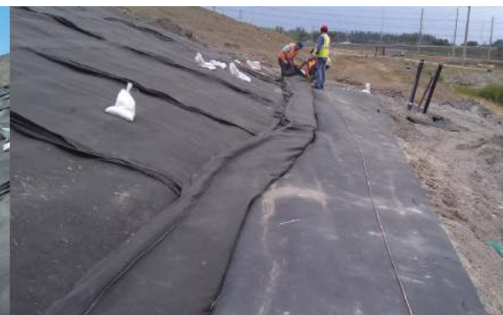
Photo 7: Then wrapped in geotextile is sewn, creating an RTDS burrito.

constructed over the cover geomembrane at the toe of the landfill slope (see Photo 3, page 31 ) such that a depression is created above the RTDS flap (see Photo 4 ) for positioning a perforated pipe (RTDS pipe) encased in gravel and wrapped in geotextile (RTDS burrito) inside the depression (see Photos 5 to 7 ). The small berm is constructed such that the extrusion weld of the RTDS flap is located at the bottom of the depression. The sloping extrusion weld of the RTDS flap provides the slope along the RTDS burrito for the flow of water inside the RTDS pipe.