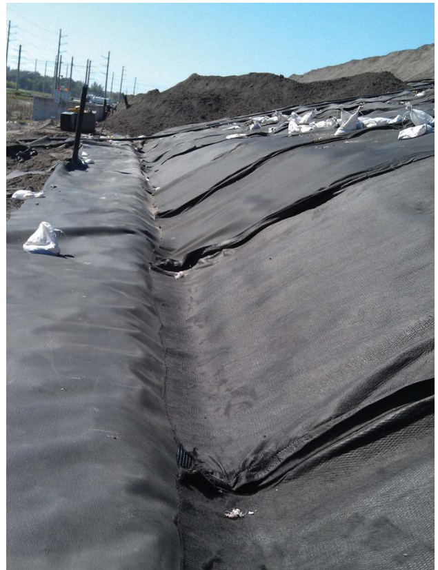
Photo 4 A depression is created above the RTDS flap for positioning the RTDS burrito.

geocomposite exposed to the open environment or buried in a gravel bedding on top of the landfill perimeter berm. Over time, it was proven that such designs could potentially fail to effectively remove water from the geocomposite due to the clogging of the geocomposite end point. Dirt accumulation, soil from erosion of cover soils from higher up on the slope, or vegetative growth around the geocomposite end point clogged the pathway for water out of the geocomposite and caused saturation at the toe of the landfill slope at the perimeter berm. The RTDS proved to be an efficient system requiring no maintenance, while performing effectively for an extended period of time. Like almost every new idea, the design had to be upgraded over time to improve performance and reduce maintenance of the system. Figure 1, page 30 illustrates the most efficient version of the RTDS with respect to location and geometry, which was adopted by clients as a standard feature in all of their final cover systems.