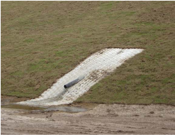
Photo 8: An erosion control mat eliminates soil erosion at the discharge.