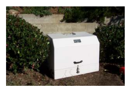
Stormwater monitoring stations can be housed in small, locking weather-proof enclosures.

To complete the package, the system allows for Short Message Service (SMS), also referred to as texts, which includes alarms and current status updates. For example, field crews can send SMS messages to the flowmeter, requesting current status. The flowmeter will then respond with battery voltage, current flow rate and rainfall totals sent to a single cell phone. This feature results in additional cost savings since cellular-enabled field crews will not require laptops or an